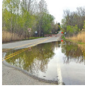
Adams closed indefinitely north of Buell Road OAKLAND TOWNSHIP