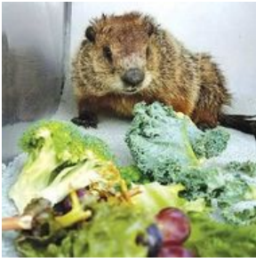
Police rescue woodchuck from under vehicle TROY