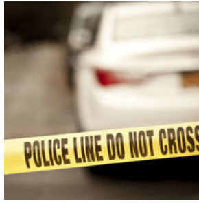
Teen dies after dispute ends in shooting, suspect in custody WARREN