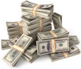
Suspect sought after bank robbery WARREN