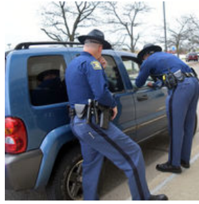
Distracted driving enforcement initiative targets M-59 METRO DETROIT